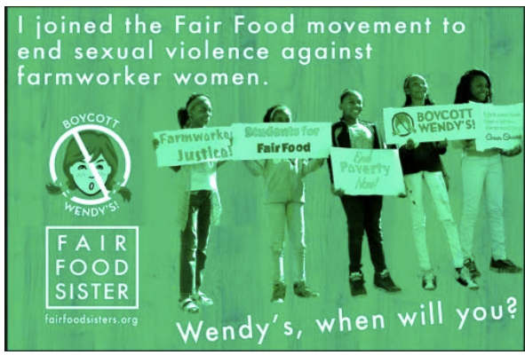
Image of the Fair Food Sisters Twitter movement to end sexual assault against farmworker women. 41

For decades, the women who harvest fruits and vegetables in the U.S. have endured sexual violence in the fields. A 2012 study conducted by Human Rights Watch indicates "80% of female farmworkers report facing sexual harassment on the job." Women are often fired for speaking up against sexual violence in the workplace while the abuser remains on the job. In 2015, the Equal Employment Opportunity Commission announced a $17 million judgment against Moreno Farm Florida and in favor of farmworkers who were regularly groped, prostituted, and raped by the farm owners' two sons and a third supervisor. The lack of incentives and aid provided by the government to victims of sexual violence in the field perpetuates their inability to seek redress and allows these abuses to remain in the dark, while offenders escape liability for malicious crimes.