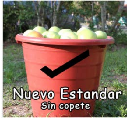
Image showing the new standards eliminating copete requirements implemented in farms participating in the FFP.<sup>38</sup>