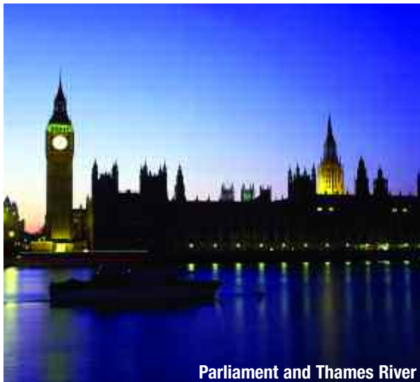
Parliament and Thames River

Due to the structure of the Summer Abroad Programs, there will be no drop/add period on site. This will be strictly adhered to. Students may drop/add a course before the registration deadline of March 30th.