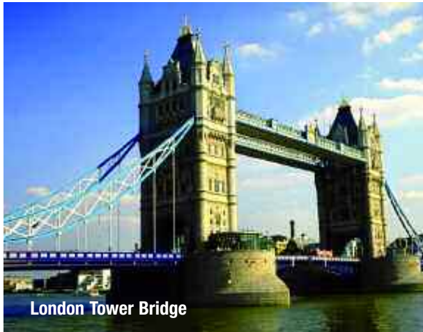
London Tower Bridge

the conduct of the ITALY OPTIONAL TRIP . In 2006, nearly 50 students enjoyed the ITALY OPTIONAL TRIP arranged by Contiki Holidays.