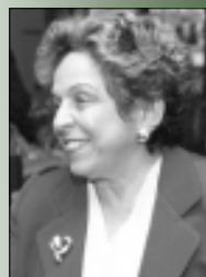
UM President Dr. Donna Shalala