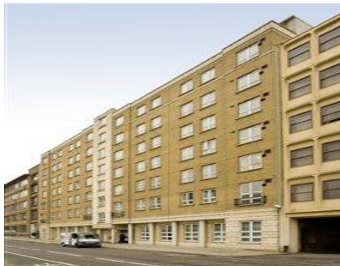
UCL Schafer House Residential Hall