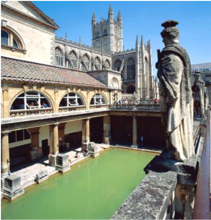
Roman Baths beside Abbey Church, Bath, England

surrounded by glorious rural countryside. There are many beautiful small villages each with their own charm and history.