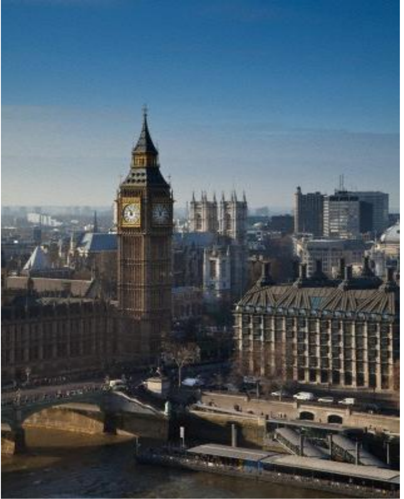
Big Ben and Houses of Parliament, London