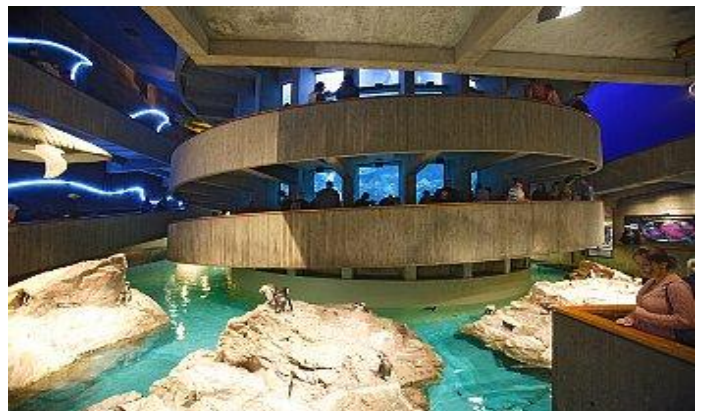
New England Aquarium, London

A non-refundable one-time registration fee of $250 and a deposit of $750, the latter to be credited against Tuition and Related Expenses, must be received with your application along with a passport size photo or similar by the March 31, 2012 deadline.