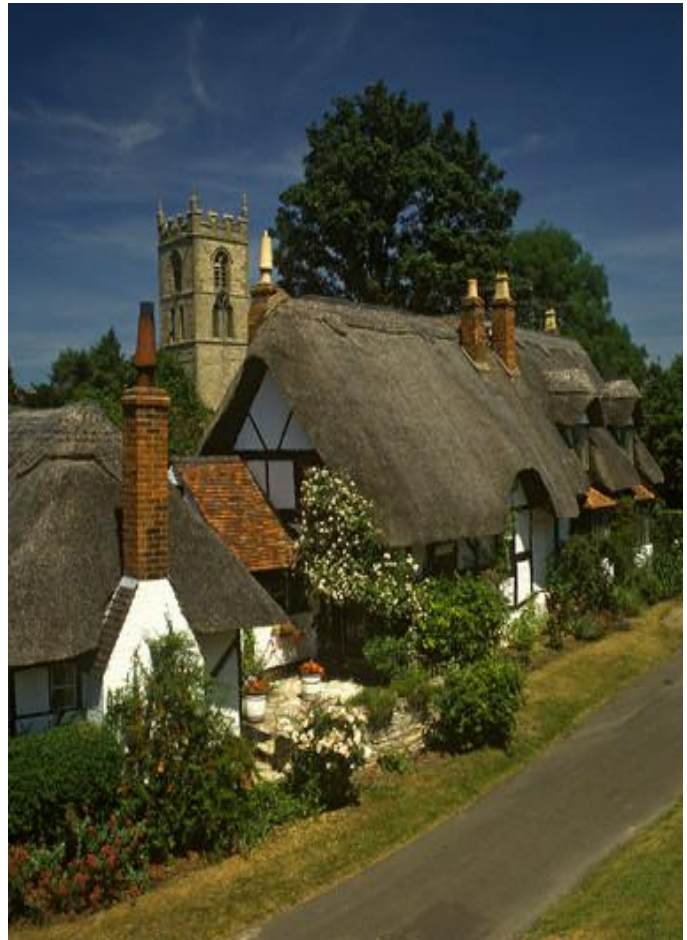
Thatched Cottage, Stratford-upon-Avon

Few cities anywhere in the world have such an enduring appeal. London continues to surprise students with its marvelous blend of Old World traditions and its ever trendsetting cultural scene. London's many cultural attractions are a mere walk away from campus, making travel and access simple and inexpensive. Museums, such as the British Museum, the British Library, art galleries, specialty exhibits and historic pageantry are all there for your enjoyment.