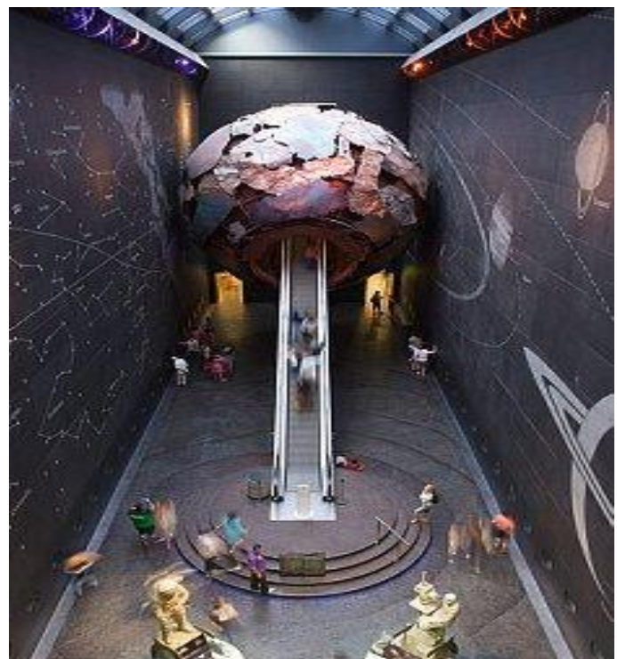
London Natural History Museum

For further information, please contact the University of Miami School of Law Disabilities Services at (305) 284-2599.