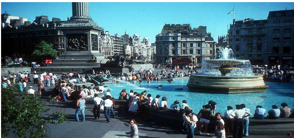
Trafalgar Square, London