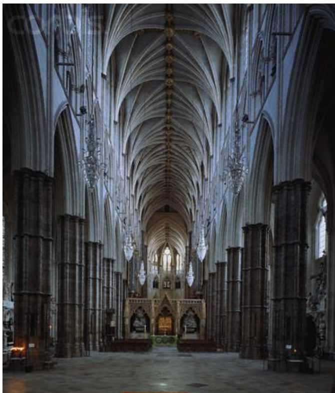
Nave of Westminster Abbey, London

University of Miami School of Law Summer Abroad Programs Office Law Library – Room G362 P.O. Box 248087, Coral Gables, FL 33124-8087 or 1311 Miller Drive, Coral Gables, FL 33146 [Express Mail] Tel: (305) 284-3656 Fax: (305) 284-9119 Email: summerabroad@law.miami.edu Web: www.law.miami.edu/summerabroadprograms