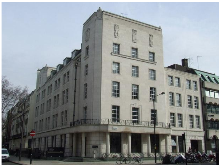
UCL Bentham House, Faculty of Laws, London