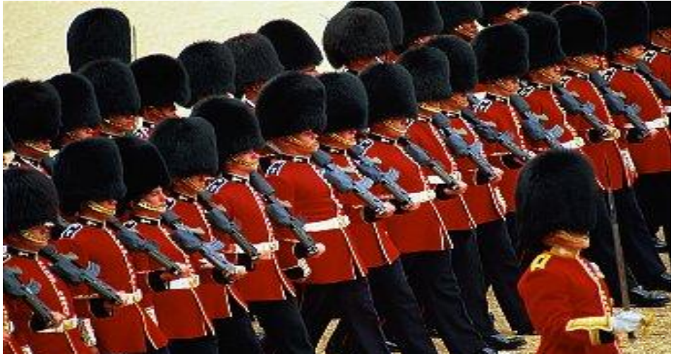
London, England UK-Trouping the Colour

Day 1 Flight to London Sun., 24 June 2012 Board your overnight flight to London! • Your adventure begins as you fly through the night to London, England.