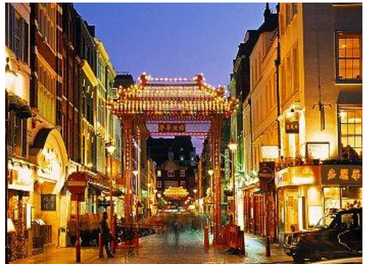
China Town, London, England

Be sure to include in your travel arrangements departure for return home from London at Program's end on Monday, August 13, 2012.