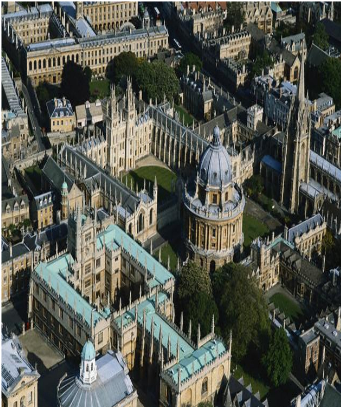
University of Oxford, England