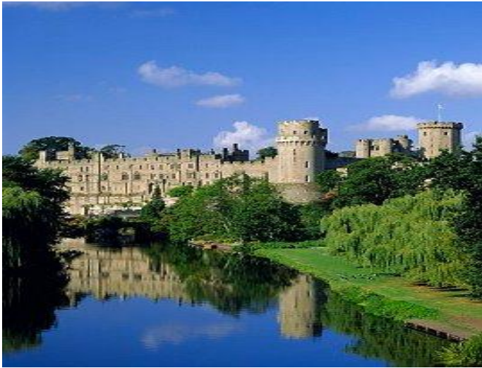
Warwick Castle, Warwickshire, England

The city caters to a wide variety of entertainment as well, serving up everything from rock, raves and jazz, to the latest stage productions offered at more than 50 theatres. The West End, close to the campus, offers more than 20 theatres, the Royal Opera House, the National Gallery, and the National Portrait Gallery. The open-air market of Covent Garden and the lively Soho area, with its pubs, restaurants, and nightclubs are a pleasant stroll away. Whether you seek to see its modern side or explore its famous past, your stay in London will surely be an experience you'll never forget.