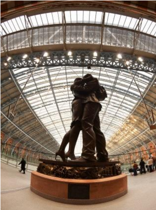
St. Pancras Station, London

Students are responsible for arranging their own ground transfers to and from all airports and for arranging flights between Session 1 and Session 2 (if applicable) as designated in the program schedule.