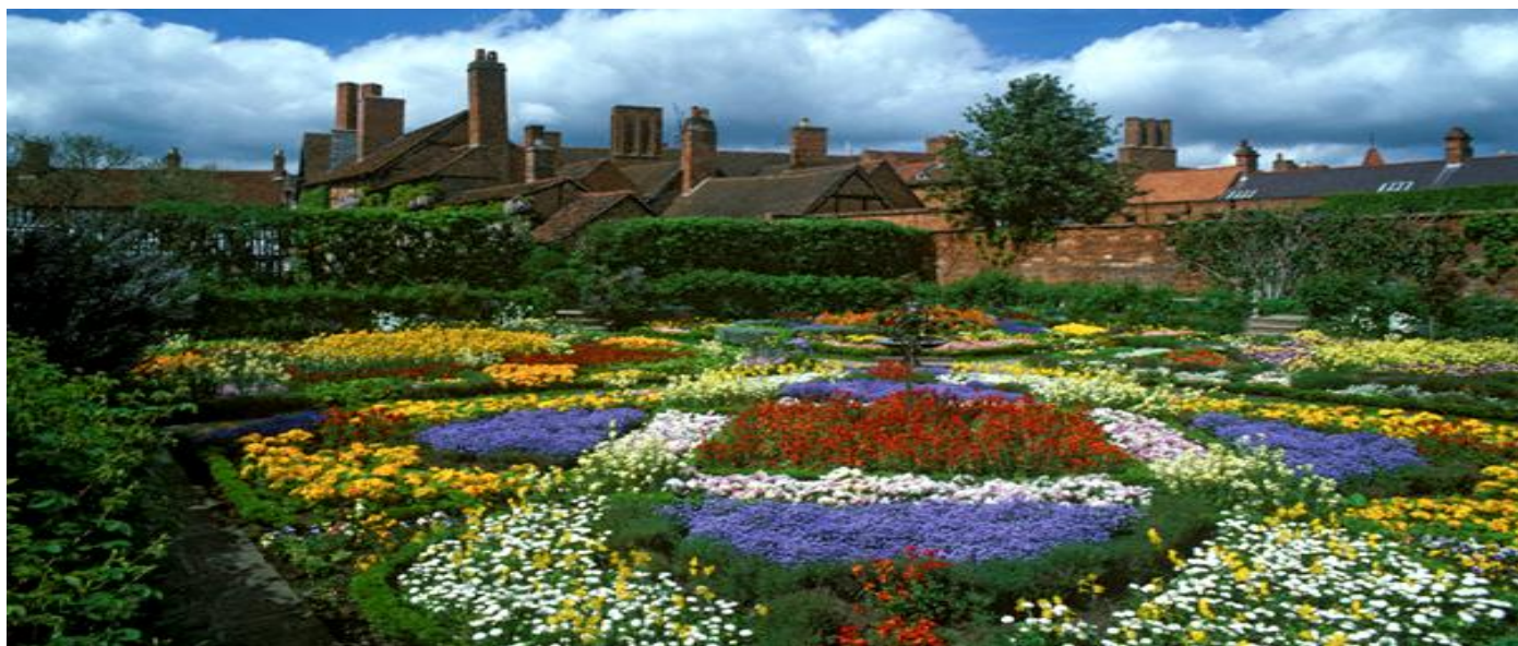
New Place Garden , Stratford-Upon-Avon, England. New Place is William Shakespeare's final place of residence during his retirement.