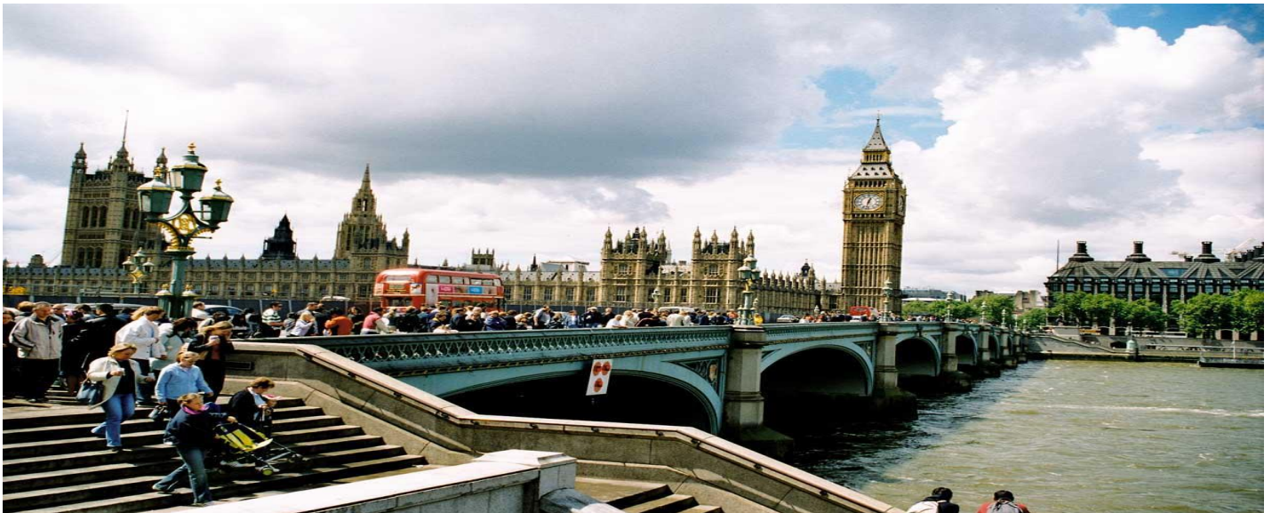
Houses of Parliament, London