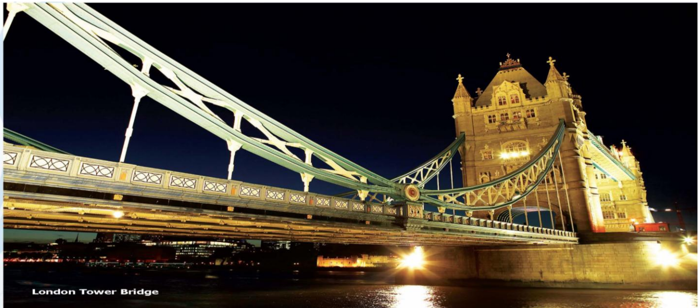
London Tower Bridge

Housing accommodations are not included during the 8-day intercession, July 16-23, 2012. All students must vacate their rooms at the end of Session 1, i.e., Monday, July 16. If you plan to stay in London during the intercession, separate reservations must be made directly with UCL Schafer House. There is no guarantee of availability during this period—rooms may or may not be available. Storage for excess baggage during the intercession will be available free of charge at UCL Schafer House for students traveling on their own or participating in the France optional tour arranged with Contiki Holidays. Prior arrangements for self-directed travel during the intercession are recommended.