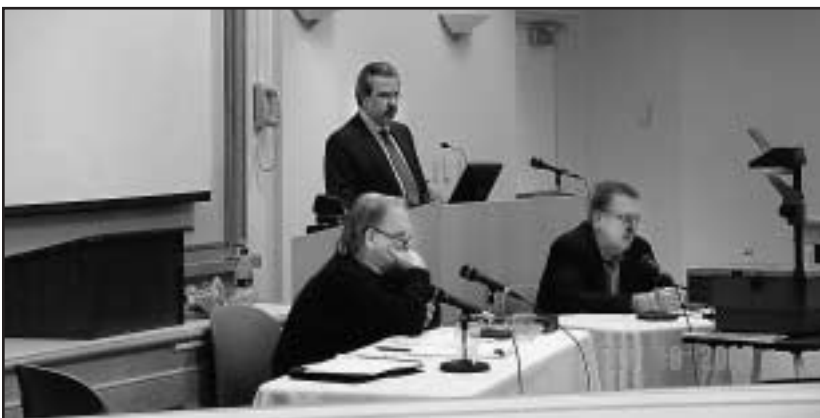
Photos from Law Review Symposium