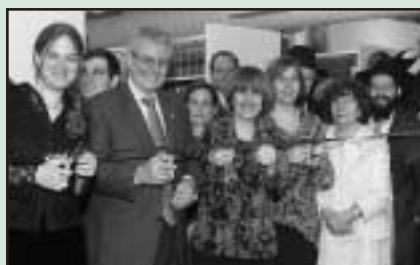
The ribbon cutting ceremony unveiling the Mayer Simcha Leiter Judaic Collection and Research Area